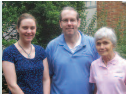
Photo: Three of our student Christian Science nurses who began their training with the introductory class.