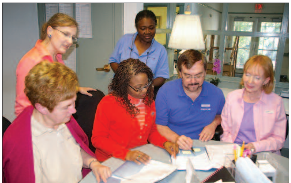
Christian Science nurses working together in harmony.