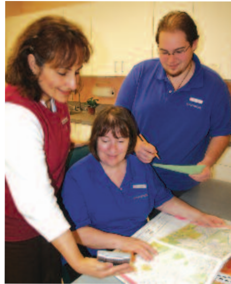
Preparing for a visit to the home

Often we are asked, “How far will you travel and how much advance notice do you need?” Christian Science nurses are ready to travel at a moment’s notice and to go wherever there is a need. Recently, we received a call in the middle of the night from someone who lives alone in another city and who had fallen. Her family, who are not Christian Scientists and do not live close by, as well as neighbors who were with her, encouraged her to go to the hospital, where the diagnosis was a broken bone. Although she agreed to have the bone set, she very much wanted a Christian Science nurse to come as soon as possible to be with her during this challenging time. When the call came, the Christian Science nurse left immediately, and over the next few days made several visits to the hospital, reading the Bible Lesson to the patient, and then brought her to Lynn House, where she improved quickly and returned home.