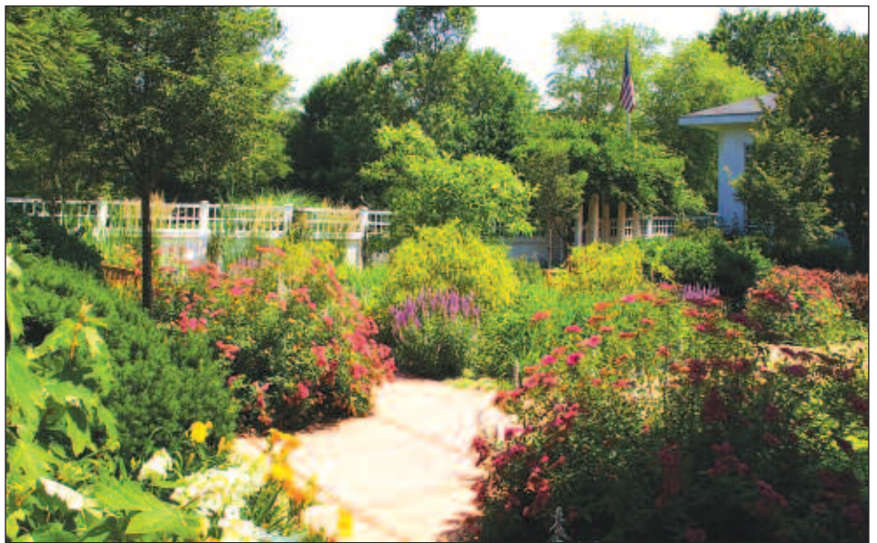
The June garden at Lynn House.

With his assistance, I made it inside the house; but I had no idea what to do next. Fortunately, my dad suggested calling Lynn House. Within minutes, the Director of the Visiting Christian Science Nurse Service was at my doorstep – armed with a wheelchair and walking aids and a sense of peace and joy. Though unconcerned with the details of