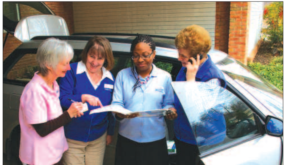
Christian Science nurses work together to support the VCSNS.

The Visiting Christian Science Nurse Service is available to adults of all ages and to children with the consent of both parents. The focus of the work is healing, and we urge you to think of us as a first and not a last resort. Never hesitate to call. We are here seven days a week 24 hours a day. ■