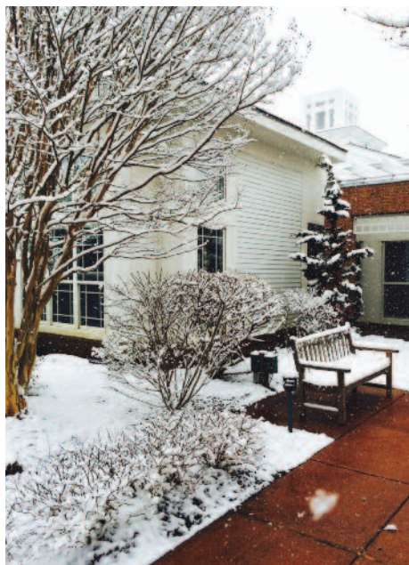
Lynn House courtyard on a snowy day.

Thinking about this story also led us to some deep questions about the spiritual nature of sustainability