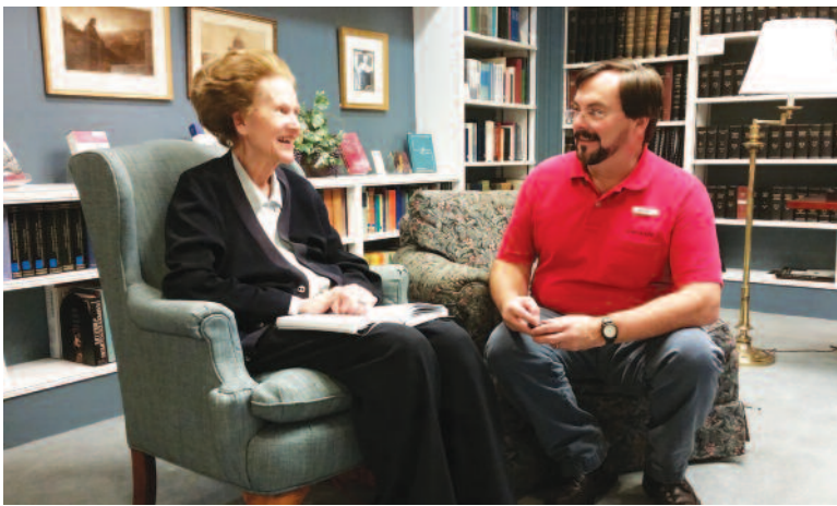
A resident and C.S. nurse enjoying conversation in the library.