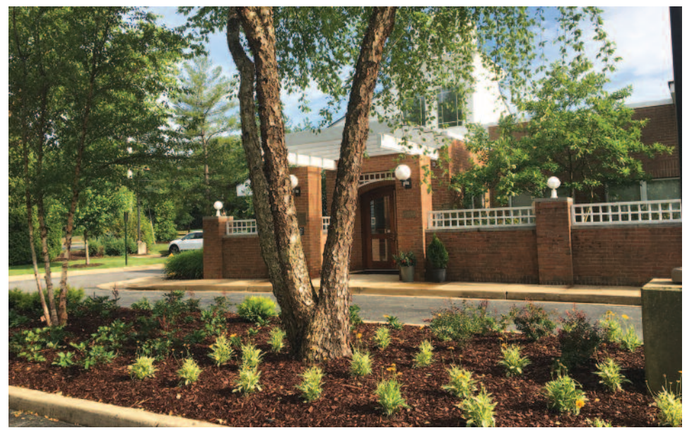
New plantings, a gift from a donor and sign of renewal

Examples include a recent tree removal at the request of a neighbor, repairs to our roof, and upgrades to our computer network to enhance the security of our IT system. New plantings in our front entrance island and in our courtyard are another lovely improvement, made