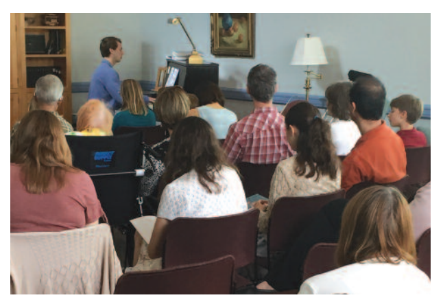
May 2019 Youth Concert

Thank you to our talented young friends for sharing your musical skills with us!