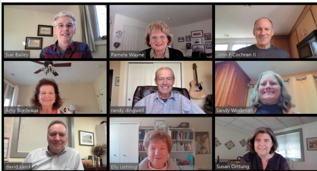
Members of the Executive Board and staff on a recent video-conference call.