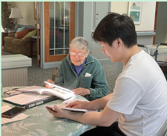
One of our residents, a former English teacher, has begun teaching English-as-a Second Language.