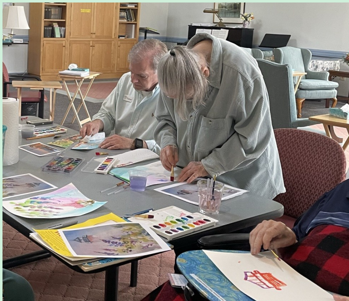
Sharing art and music together